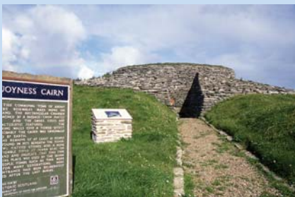
Quoyness Chambered Cairn

Quoyness Cairn was built around 5,000 years ago, in the same era as Maes Howe on Orkney mainland, and was also probably a burial site. The glass roof is modern, but the stonework of the main chamber stands to its original height of 4 metres. Be ready for a crawl through the low entrance, the roof here is only 0.6 metres high.